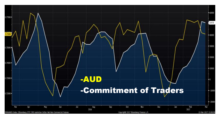
AUD trades in sync with trader sentiments (Bloomberg)

Trader sentiment can be measured via commitment of traders (COT) report from the US Commodity Futures Trading Commission (CFTC), but how politics will play out in foreign exchange markets remains highly uncertain.